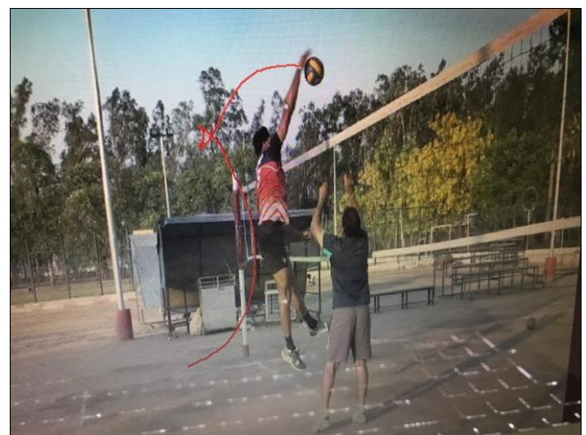
Fig 1: The horizontal velocity of Wrist joint at time of short spiking through “Quintic coaching v-17 software.”