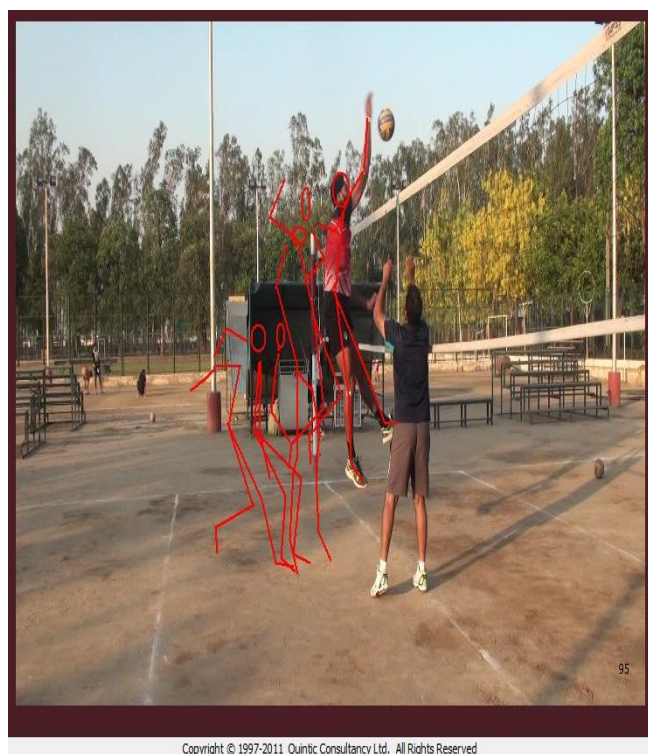
Fig 3: Stick figure analysis of a short spike technique through "Quintic coaching v-17 software."

The simplest drawing of a human being, one where the torso, arms and legs are just lines while the head is a circle. It's the greatest creation of humankind which helps to understand the different body segments during very movements. A fundamental challenge that arises during analysis to visual sequences is the problem of describing the motion of non-rigid objects. The ordinary approach while dealing with human motion is to fit the data with an articulated kinematic model, or "stick-figure", composed of a number of rigid parts connected by flexible joints. The structure of a stick-figure the shape of each body part or "stick" and the connectivity between them remains fixed across time, while motion is encoded as a sequence of pose parameters the joint horizontal velocities between connected sticks permitted to vary at each time step. The joint horizontal velocities derived from a stick-figure provide a more-parsimonious representation of the data, suitable for higher level modelling of human motions. For example, stick-figure models are used to convert feature positions obtained from optical motion-capture to joint horizontal velocities, which can be used to animate computer generated characters.