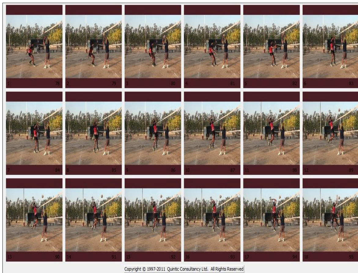
Fig 2: Strobed photo sequenc of a short spike technique through “Quintic coaching v-17 software.”

is the component of dynamic visual acuity. Dynamic visual acuity can be described as the ability of an individual to track a moving object, while his/her head is moving at the same time. More specifically, dynamic visual acuity is the ability of the visual system to resolve detail and to discriminate the fine parts of a moving object when there is relative movement between the object and the observer.