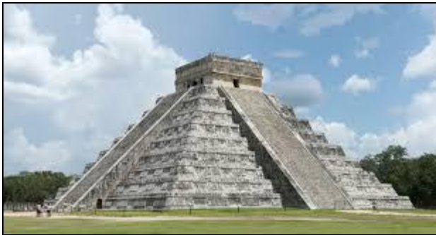
Fig 6: Temple of Kukulkan at Chichen Itza