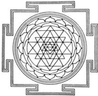
Fig 1: Sri Yantra