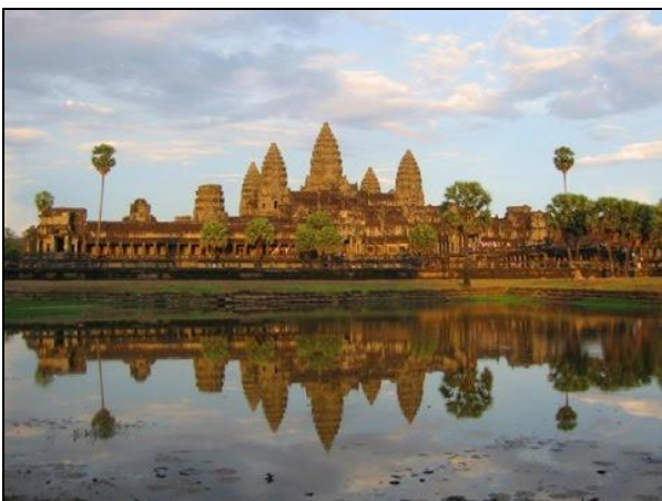
Fig 7: Angkor Wat temple in Cambodia