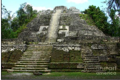
Fig 5: Temple of Lamanai