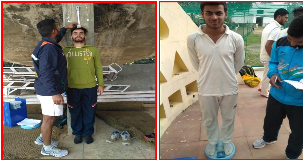
Fig 1: Illustrations of Standing Height Measurement and Weight Measurement.

The study was descriptive study focusing on anthropometric variables among cricketers of Chandigarh; a sample of state level male cricketers was taken purposively as a subject for the study. The subjects of the study were sixty state level male cricketers (20 batsmen, 20 spinners and 20 fast bowlers) of Chandigarh. The age of the subjects were ranging between 19 to 25 years. In consultation with experts and considering tester's competency and even feasibility criterion in mind, especially of equipments reliability and time factor, the following anthropometrical variables were selected for the study namely: height, weight, arm length, thigh length, calf length, biceps unflexed, biceps flexed, thigh girth and calf girth. Height was measured in nearest centimeter, weight was measured in nearest kilogram and arm, thigh and calf length, biceps unflexed, biceps flexed, thigh and calf girth were measured in centimeters.