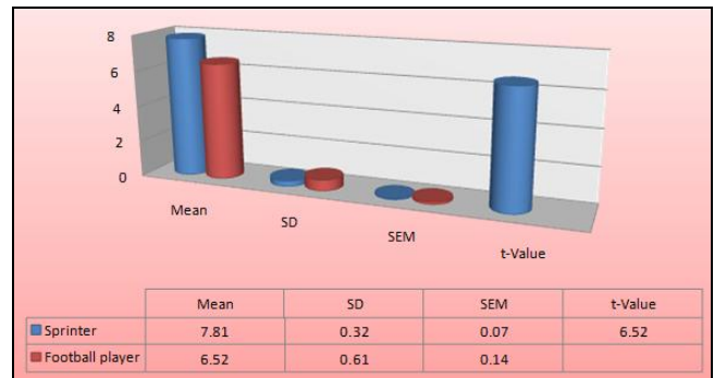
Fig 2: Mean Values ( \pm SD), Standard Error of the Mean and Test Statistic t of 50 Yard Run in sprinters (N = 20) and football players (N = 20).

Table 2: shows that the mean of 50 Yard Run of sprinters and footballer players was 7.81 and 6.52 respectively, whereas the standard deviation (SD) of 50 Yard Run of sprinters and footballer players was 0.32 and 0.61 respectively. The critical value of t at 95% probability level is lower (2.021) than the observed value of t (6.52*). The data does suggest that the differences between sprinters and footballer players in regard to 50 Yard Run are significant.